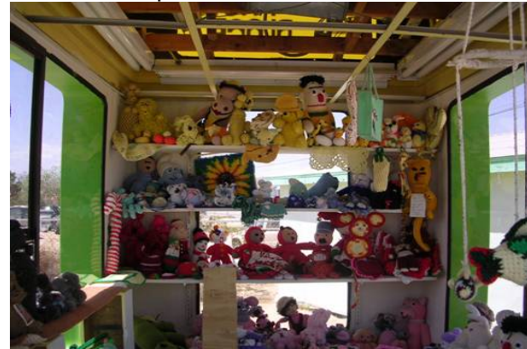
The Crochet Museum