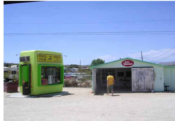
The Crochet Museum in progress