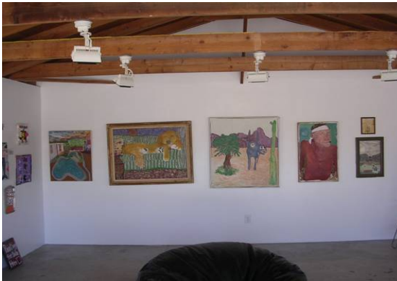
The gallery East, these are Victoria's & The gallery West