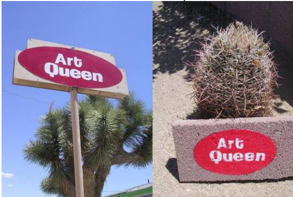
Our excellent hand painted signage